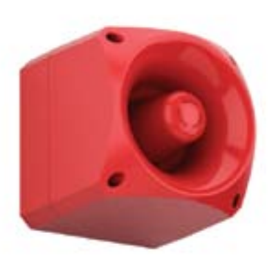
Applications - Conveyors; process control alarm; cranes; moving machinery; general signalling